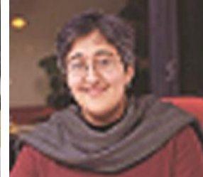
Ms. Atishi Marlena