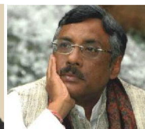
Mr. Pavan Varma