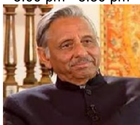
Mr. Mani Shankar Aiyar