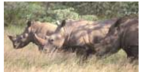
A trio of White Rhino in Zululand

Reserves include Hluhluwe and Umfolozi, with lion and elephant, and the escarpment landscape of Itala where herds of rhino are common, as are wildebeest, giraffe, zebra, eland, hartebeest, kudu and impala.