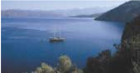
Our Yacht M/S Sultan in Lycia