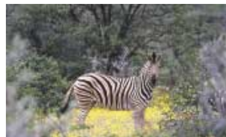
African Plains Zebra among spring flowers

The Nqutu Plateau is the living heart of the Zulu nation and includes two of the famous sites from the Anglo-Zulu war of 1879 – Isandlwana and Rourke's Drift. For anyone interested in Southern Africa, the visit is a deeply moving experience.