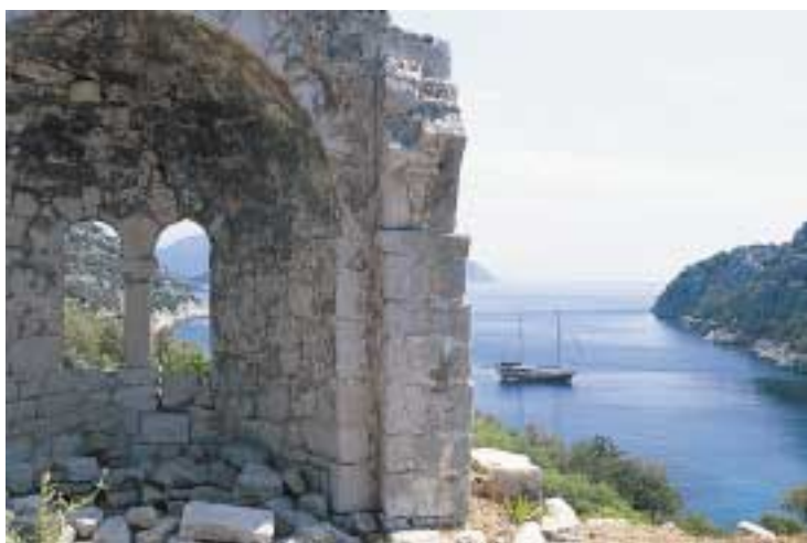
The Temple of Apollo, Naxos

For this cruise to the heart of the Aegean we use Turkish gulets; hand-built, traditional-style motorised sailboats, which combine comfort with the ability to visit many ports and sites out of bounds to large liners. The islands of the Cyclades offer a rich mythological landscape,